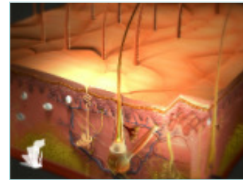
Skin By Visible Productions